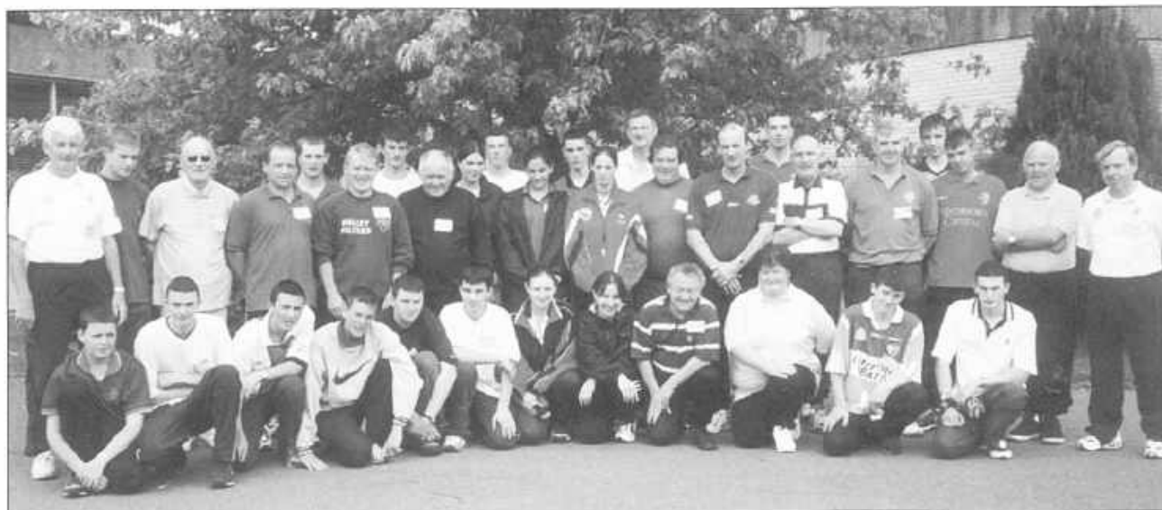
Tutors and participants at the National Coaching Course at St Augustine's College, Dungarvan in August.