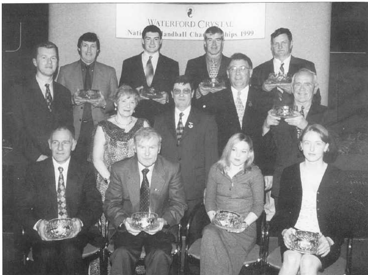
The recipients of the Waterford Crystal awards pictured at the banquet in May: