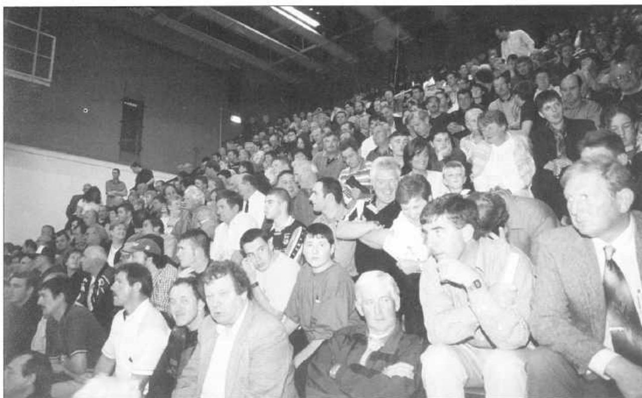
A section of the capacity crowd enjoying the All-Ireland softball finals at Páirc an Chrócaigh.